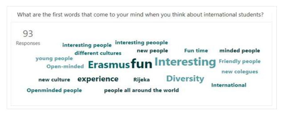
Figure 6: Locals' first associations with Erasmus+ students

More than half of the locals acknowledged that they met with international (Erasmus+) students in Rijeka, and only a tiny percentage of the responders stated that they had not met any international students at all. However, to understand locals' overall perception, all locals were asked about the first thought that comes to their minds when considering international students. According to their answers, the outcome emphasises an optimistic overview of locals and suggests welcoming behavior towards visitors (see Figure 6). Therefore, the findings indicate that according to Fletcher's (2018) theory, Rijeka has good management in terms of tourism and a fair speed of development to accommodate visitors and positively welcome them.