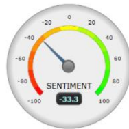
Figure 1: Sentiment analysis of tourism advertising messages